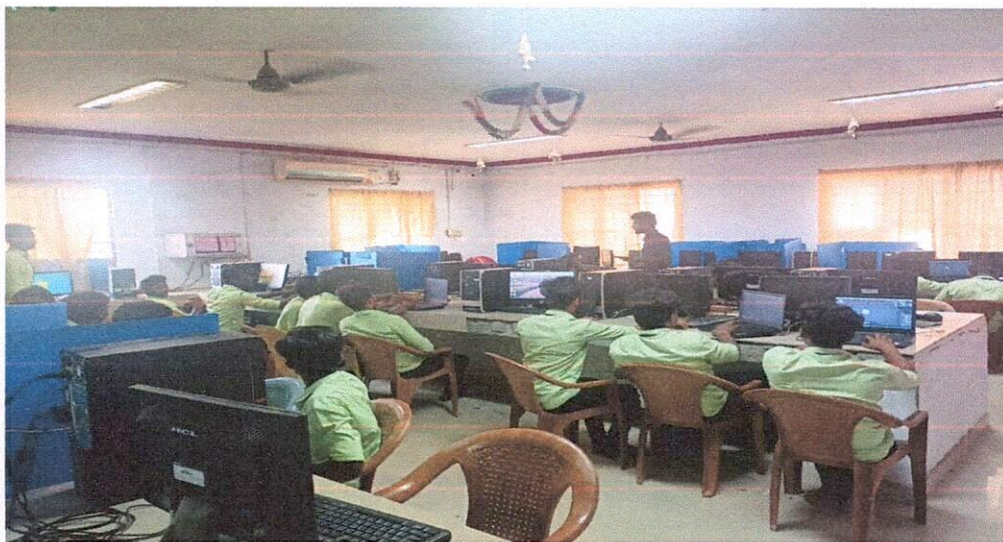
Students are actively participated in the workshop programme on 08 October2021 at CAD Laboratory, PSNEC