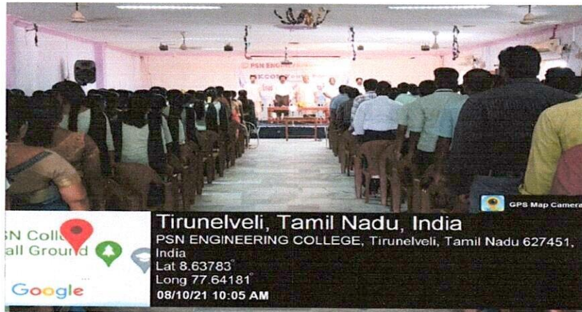
A section of the students gathered for the Life Skill Programme conducted at PSNEC Seminal Hall on 8.10.2021.