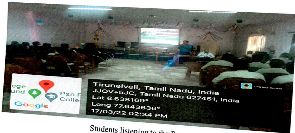
Students listening to the Program