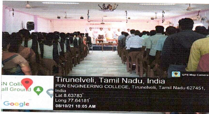
A section of the students gathered for the Life Skill Programme conducted at PSNEC Seminal Hall on 8.10.2021.