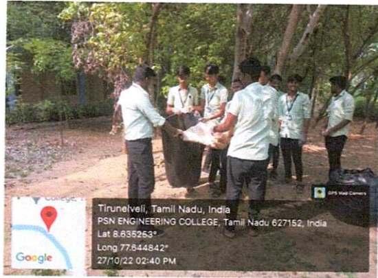
PSNEC NSS Volunteers ready for Campus Cleaning