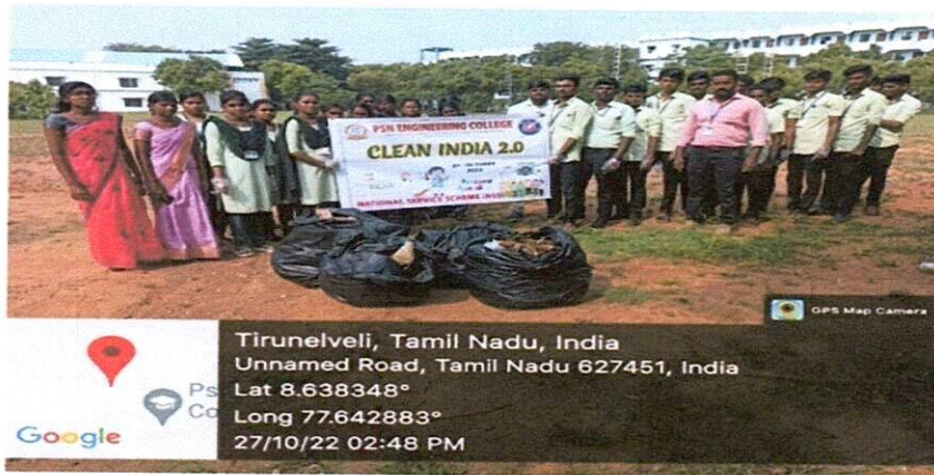
NSS Volunteers collected waste in PSNEC college campus