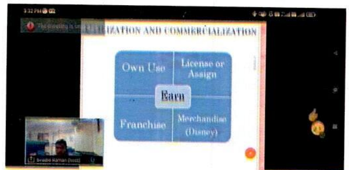
The resource Person Delivering a Lecture on Utilization and Commercialization during Awareness Program on IPR on 16 th March 2022